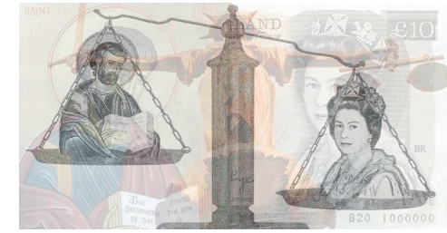
Reuben the Hood