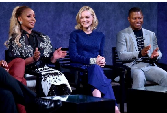
Mary J. Blige, Carey Mulligan, Jason Mitchell at the New York screening of MUDBOUND