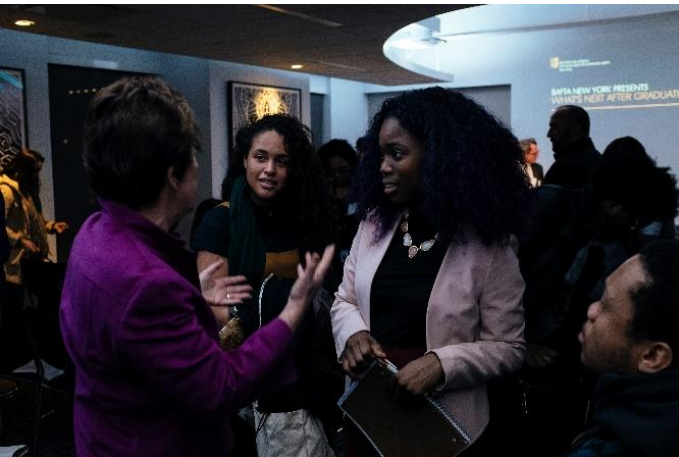
BAFTA New York's 'What's Next ... After Graduation' event

BAFTA New York views the scholarships as more than financial support. We seek to encourage a strong relationship with the scholars and their sponsors and truly welcome them to the BAFTA New York family.