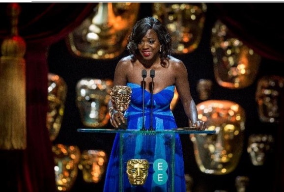
Viola Davis at the 2017 Film Awards