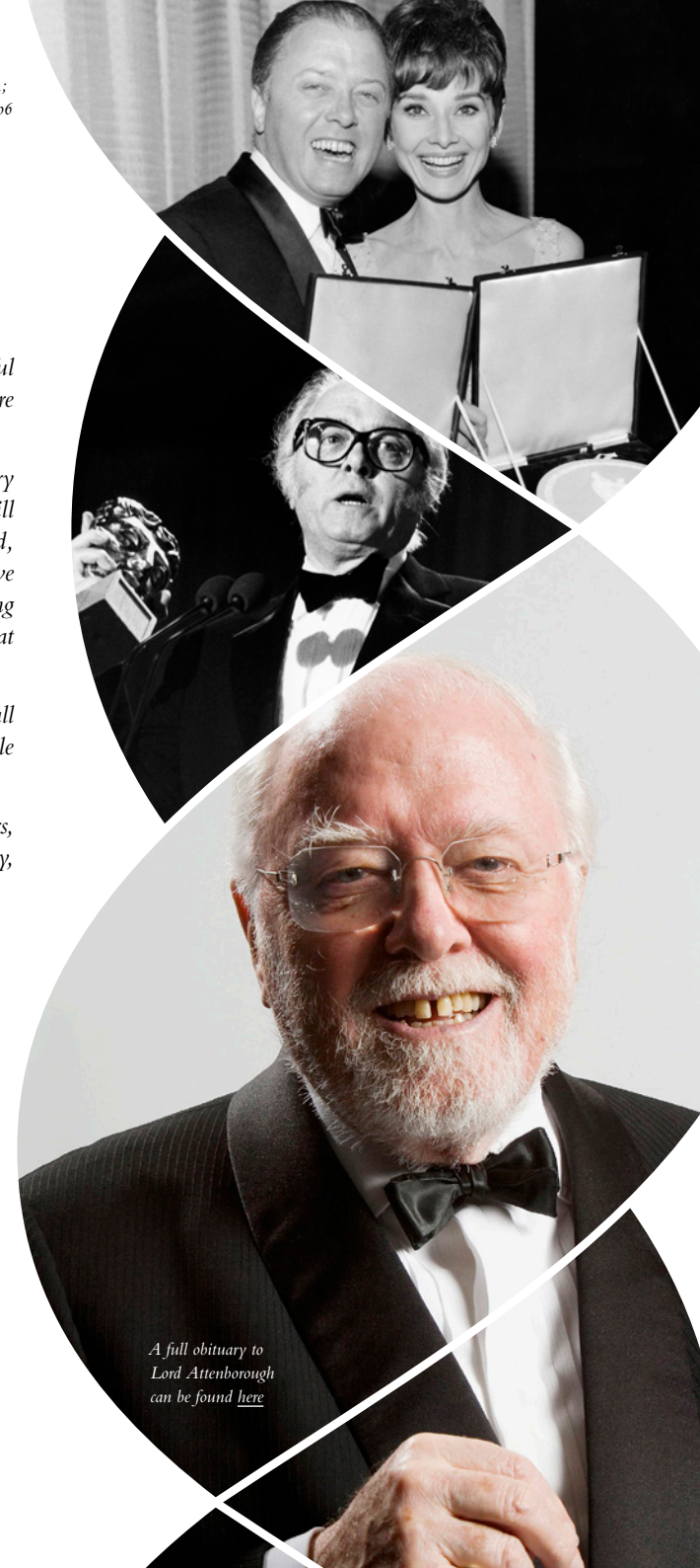
A full obituary to Lord Attenborough can be found here

Yes, Dickie, we will remember we are in show business!