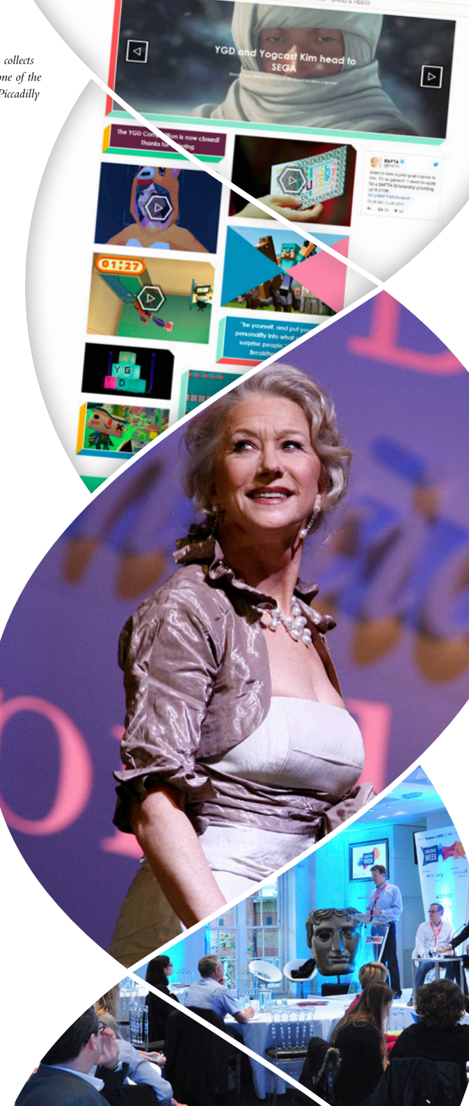
From top: The relaunched YGD website; Helen Mirren collects her Leading Actress award for The Queen in 2007, one of the 100 Moments project; Creative Week at BAFTA 195 Piccadilly

The number of archival moments used in our special online feature created to generate public excitement in the 100 days leading up to the Film Awards. The 100 Moments project used both still and moving image material from the BAFTA Archive to showcase the history of the Film Awards across the decades.